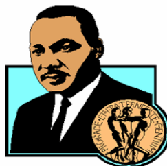
The 24th Annual Johns Hopkins Commemoration of Dr. Martin Luther King, Jr.